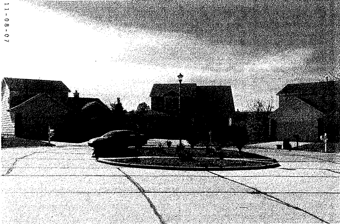
Taking to the west